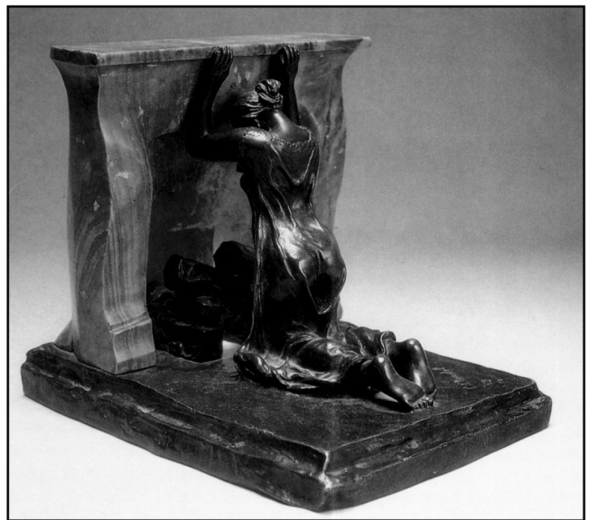
Claudel, Pensée Profonde , 1905

https://creatureandcreator.ca/wp-content/uploads/2015/04/didonato-lavalse.mp3