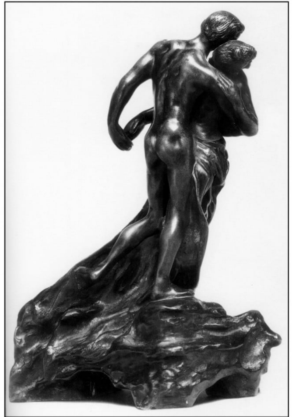
Claudé, La Valse , 1891-1905

After her break with Rodin, Claudé worked as an independent artist. She had very little money to support large bronze castings and her major sales involved small pieces for tabletop. Camille became adept at creating sculptures for personal rather than public enjoyment. Two pieces are worth noting. The first is The Waltz , several copies of which were cast in bronze. One graced the piano of Claude Debussy. Its fascination lies in the way it combines both movement and stillness.