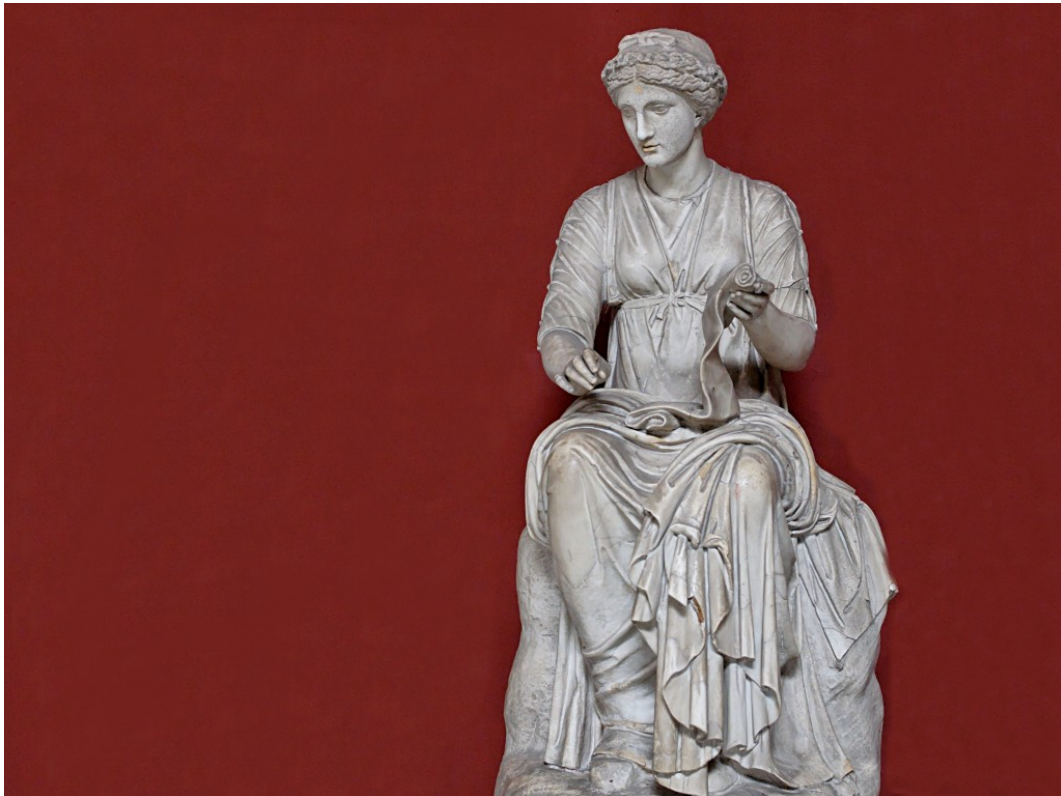
Clio, Museo Pio Clementino

Although psychology has become an established science, it still has deep connections to philosophy. This is particularly true when we consider the concept of person that is at the foundation of all psychology. A person exists (and persists) through the processes of consciousness and memory. The following photograph (by Marie-Lan Nguyen) shows a Roman statue of Clio, the muse of history, from the Museo Pio Clementino of the Vatican. Clio records what is happening and recalls what has happened. History ensures that the past persists. The past helps us to understand the present.