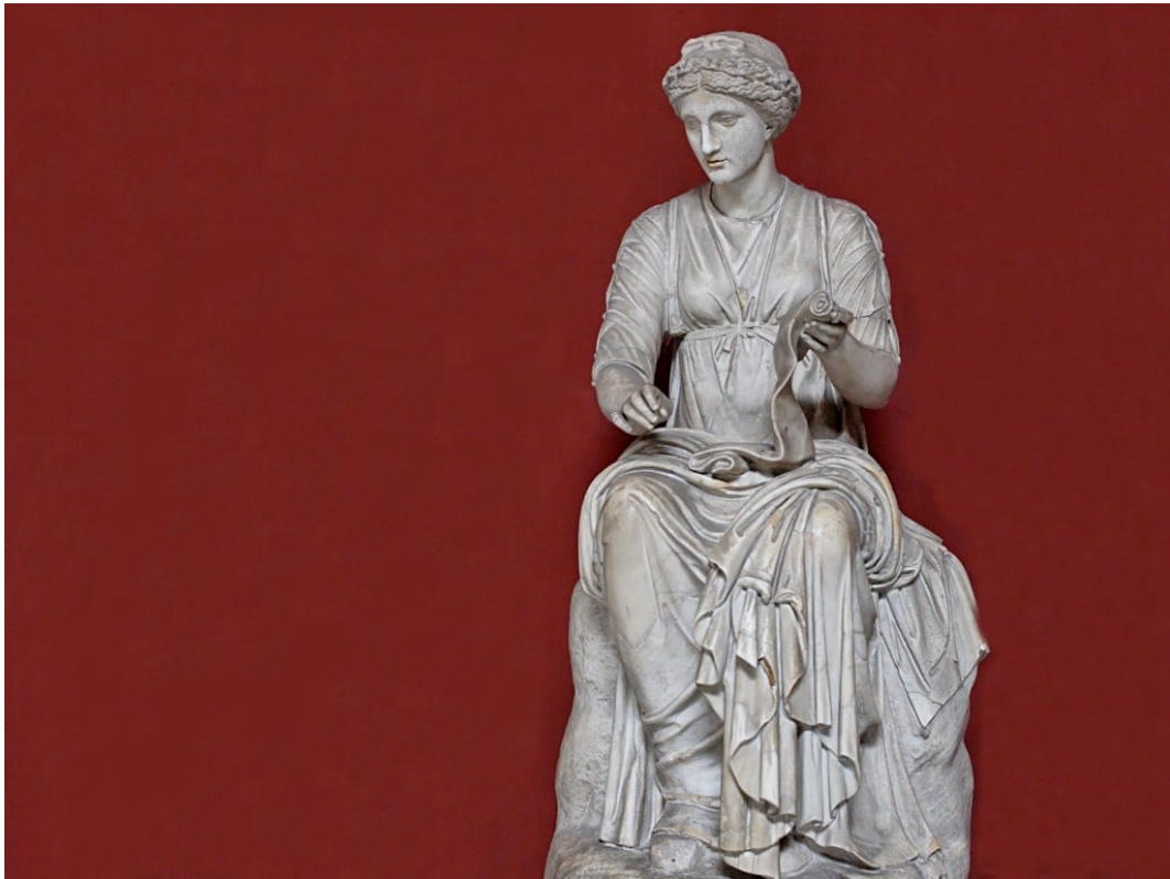
Clio, Museo Pio Clementino

Although psychology has become an established science, it still has deep connections to philosophy. This is particularly true when we consider the concept of person that is at the foundation of all psychology. A person exists (and persists) through the processes of consciousness and memory. The following photograph (by Marie-Lan Nguyen) shows a Roman statue of Clio, the muse of history, from the Museo Pio Clementino of the Vatican. Clio records what is happening and recalls what has happened. History ensures that the past persists. The past helps us to understand the present.