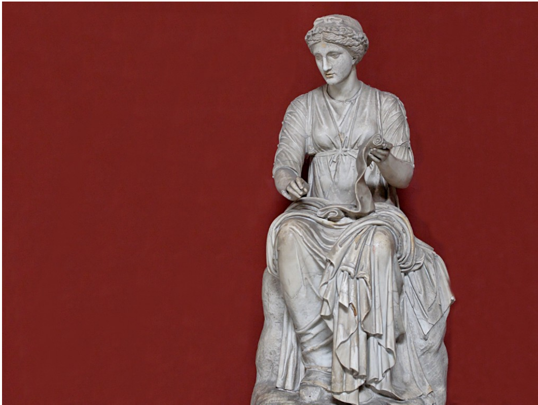
Clio, Museo Pio Clementino