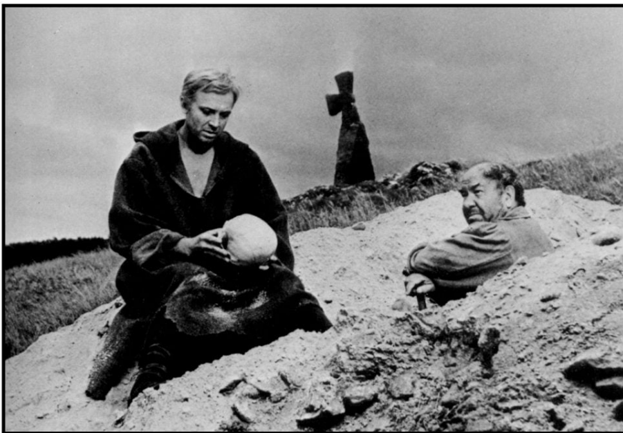
Innokenti Smoktunovsky in Kozintsev's Movie

So I think that Hamlet in this speech is indeed considering the human condition. The habit of his mind is to interpret the events of the moment according to eternal principles. The student from Wittenberg is an inveterate philosopher. Hamlet's meditation on the skull of Yorick shows a similar way of thinking..