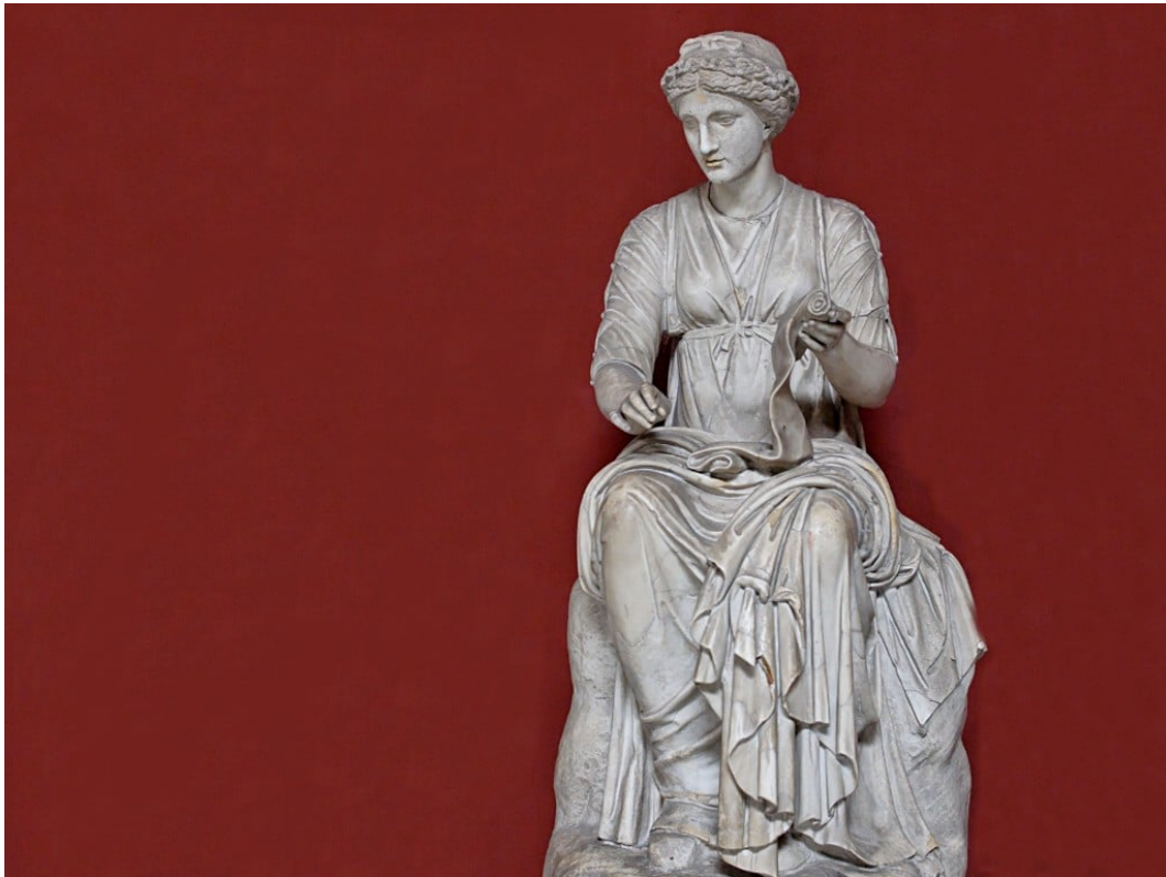
Clio, Museo Pio Clementino

Although psychology has become an established science, it still has deep connections to philosophy. This is particularly true when we consider the concept of person that is at the foundation of all psychology. A person exists (and persists) through the processes of consciousness and memory. The following photograph (by Marie-Lan Nguyen) shows a Roman statue of Clio, the muse of history, from the Museo Pio Clementino of the Vatican. Clio records what is happening and recalls what has happened. History ensures that the past persists. The past helps us to understand the present.