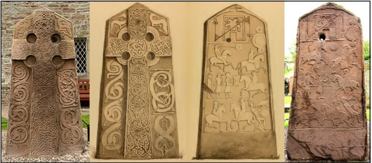
Aberlemno Churchyard Stone