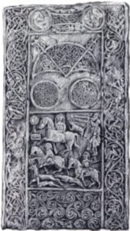
Hilton Cadboll Stone

The Hilton Cadboll stone shows a beautifully carved hunting scene with a lady riding side-saddle. The cross side of the stone was erased and inscribed with a 17 th century memorial. The stone was transferred to the National Museum of Scotland, and a replica by Barry Groves was erected at the original site. The illustration at the right shows a drawing by Mike Taylor (MacNamara, 1999) and below is a photograph by