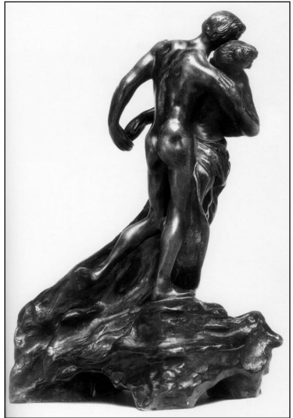
Claudé, La Valse , 1891-1905

After her break with Rodin, Claudé worked as an independent artist. She had very little money to support large bronze castings and her major sales involved small pieces for tabletop. Camille became adept at creating sculptures for personal rather than public enjoyment. Two pieces are worth noting. The first is The Waltz , several copies of which were cast in bronze. One graced the piano of Claude Debussy. Its fascination lies in the way it combines both movement and stillness.