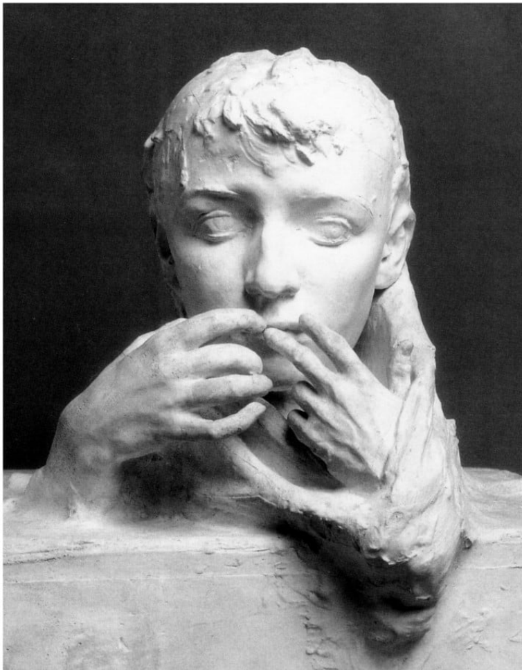
Rodin, L'Adieu , 1892

We should not leave Camille without seeing her as she was in her time of passion and creation. One of the most insightful impressions of Camille is a plaster cast by Rodin, a portrait of Camille, aptly entitled The Farewell . Both the hands and the face are exquisitely moulded. The sculpture is ambiguous. Are the hands reaching up to stop the tears, to shut out the world, or to gather something in?