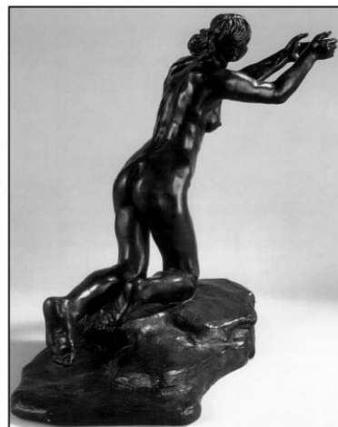
L'Implorante , 1900