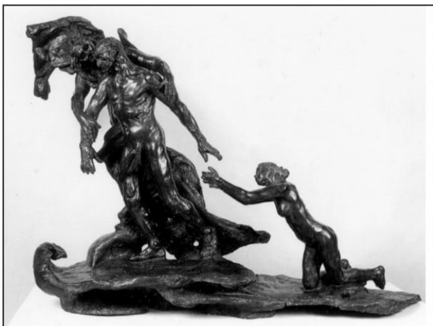
L'Age mûr (maquette), 1898

At the time that she was ending the affair with Rodin, Camille was working on a sculptural ensemble called the L'Age mûr (Maturity). It depicts a man being led away from a pleading young woman by an old woman. The figure of the young woman was also reproduced by itself as L'Implorante (Suppliant). The ensemble can be interpreted as fate leading man away from youth toward death. However, it is impossible not to see the Rose Beuret, Rodin and Camille in the figures.