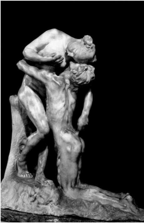
Claudel, Sakuntala , 1888-1905