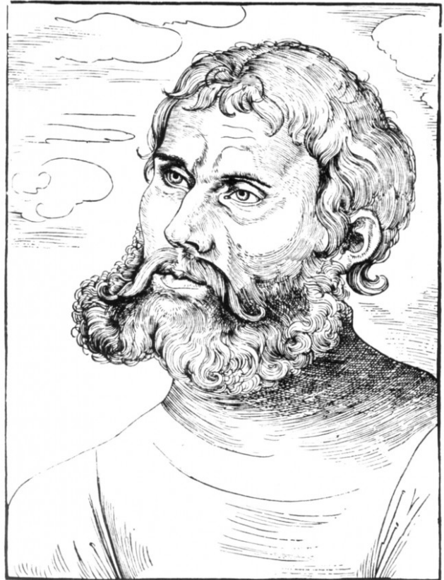
IMAGO MARTINI LVTHERI, EO HABITV EXPRESSA, QVO REVERSVS EST EX PATHMO VVITTEBERGAN. Anno Domini. 1 5 2 2.

Quæritus tones, toties tibi Rhoma petitus, En ego per Christum vivo Lutherus adhuc. Vna mihi spes est, quo non fraudabor, Iesus, Hunc mihi dum teneam, pericula Rhoma vale.